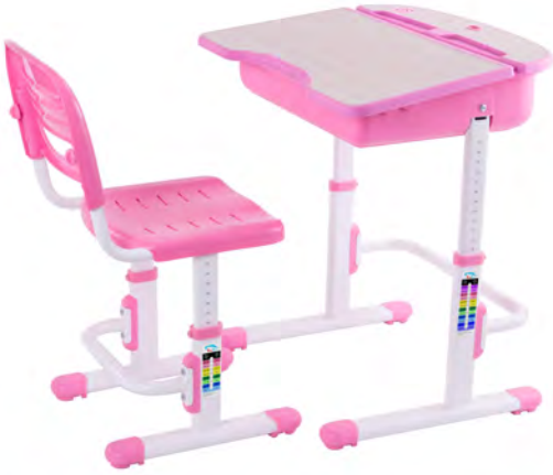
C301 Slope Desktop • Large Storage Box