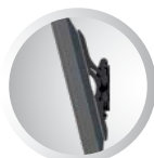
Tilts up to +15° tilt