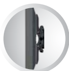
Tilts up to -15° tilt